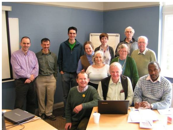
Some of the attendees at the UK conference

Conferences Report The VM conferences in Texas in the USA and in Derbyshire in the UK both went well and are now over. I hope to have a fuller report plus information on how to get to see videos of some presentations and papers in the next Bulletin (May 2012). Please send me your input regarding ‘where to go now’, as we are considering future activities in the light of the success of recent conferences. (Write to jim@vulnerablemission.org )