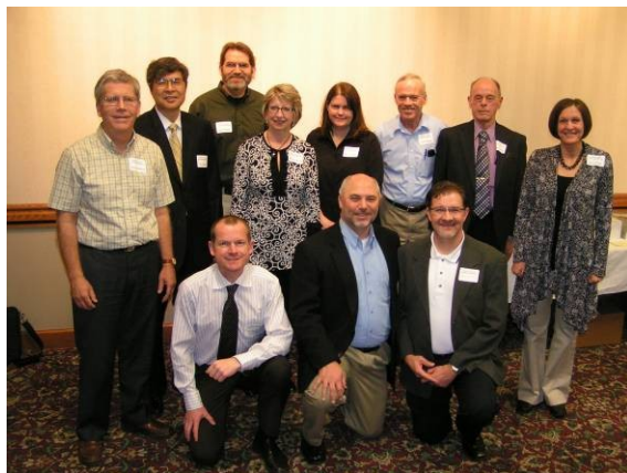
Speakers at the US conference