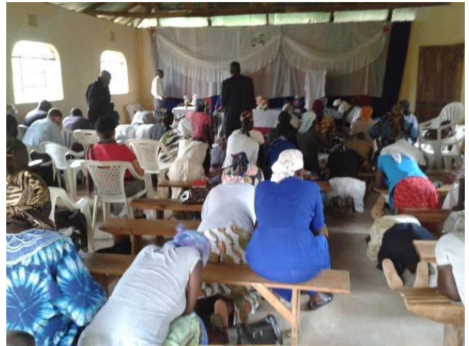
Prayer time in a church near my home