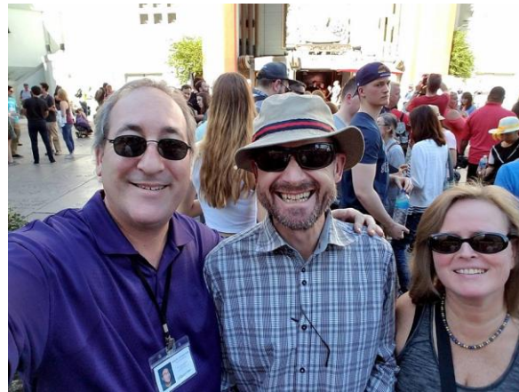
With German cousins in the USA, October 2017

Sent by: Andover Baptist Church, Charlton Road, Andover, Hants SP10 3JH http://www.andoverbaptist.org.uk/content/view/14/14/