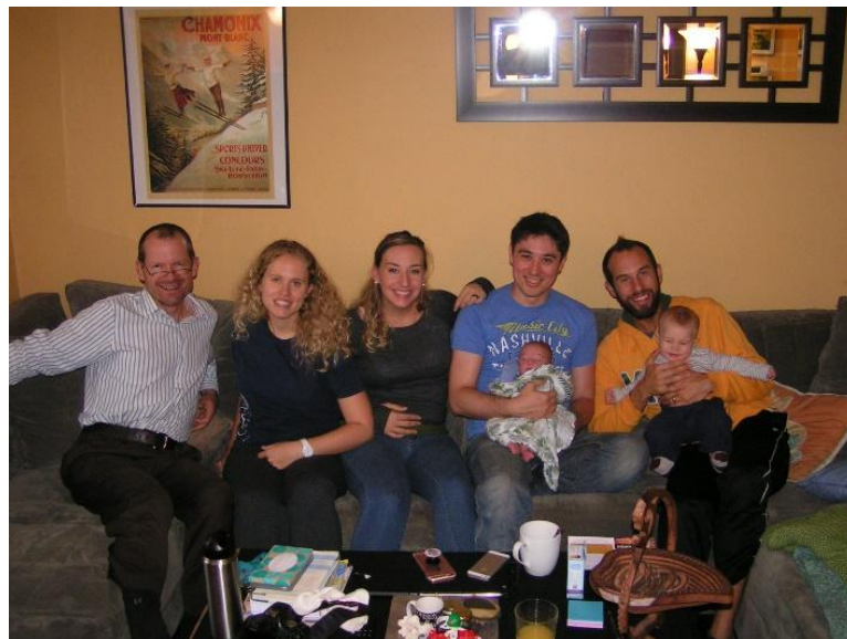
Myself meeting some cousins and their families in the USA, November 2017.