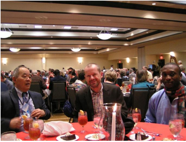
Myself at bible-translation conference in Dallas, USA October 2017 – final banquet.