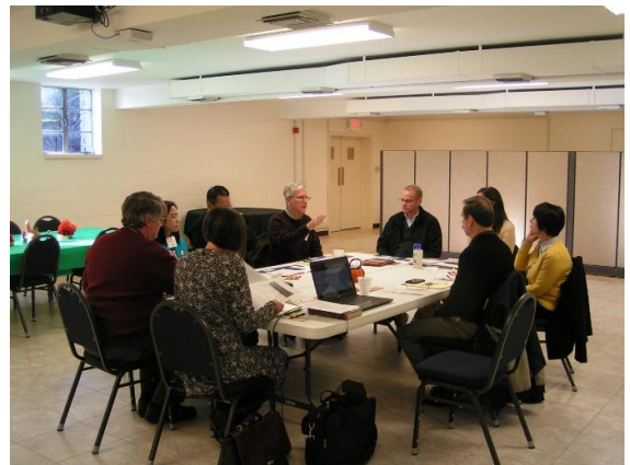
Our conference on vulnerable mission that was held in Pennsylvania, USA, November 2017